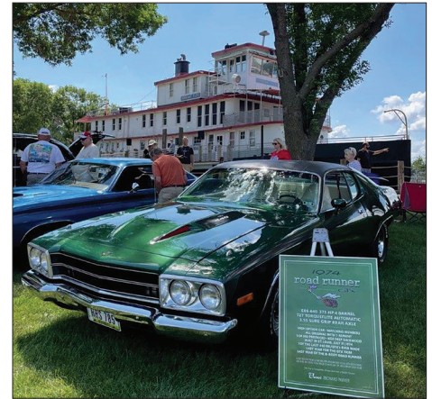
The riverfront provided a beautiful location for special events like the annual car show in July 2021.

The Sergeant Floyd River Museum & Welcome Center "welcomed" 51 school tours,