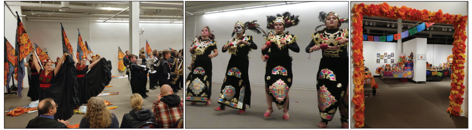
From left to right: A new Thursday evening event included performances by the North High School Marching Band and Ballet Folklorico Estrallas de Jalisco. Hundreds of marigolds were created by the community and local schools for the Museum's Día de los Muertos archway to the altar display.

This year's theme, Creciendo Nuestras Raíces (Growing Our Roots), focused on the indigenous elements of the Mexican Day of the Dead. The marigold flower, or the Flower of the Dead, takes its name from Nahuatl, the Aztec language. Marigolds are frequently placed on altars in the belief that fragrance attracts the spirits of the dead. Often found within homes or public