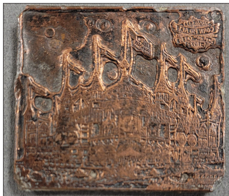
Found on a Nebraska farm, this printing block depicts the proposed 1893 Corn Palace. Due to the Floyd River Flood of 1892 and the 1893 Financial Panic, the era of Corn Palaces in Sioux City ended after 1891.